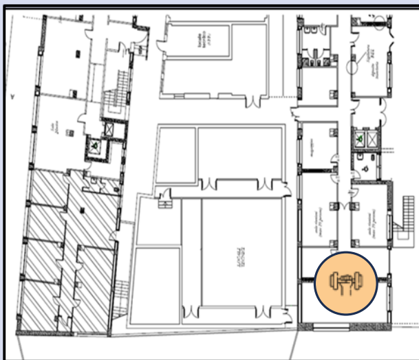
basement - south side